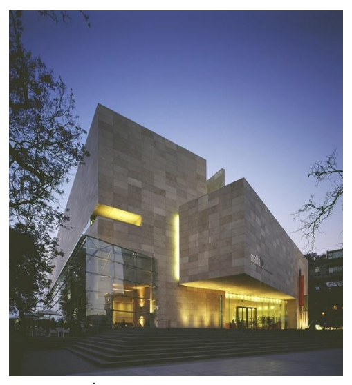
"Museums Illuminate" action at MALBA

- RAME ACTION 2: From July 2020, RAME submitted successive formal reopening requests to the GCBA and contributed to the preparation of the reopening protocols. (See Annex 2. Reopening arguments)