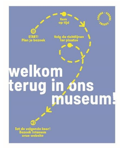
Welcome back to our museum! National poster developed by the Flemish Museum Council.

management. Added to that was an underlying concern about the cultural quality of the public offer.